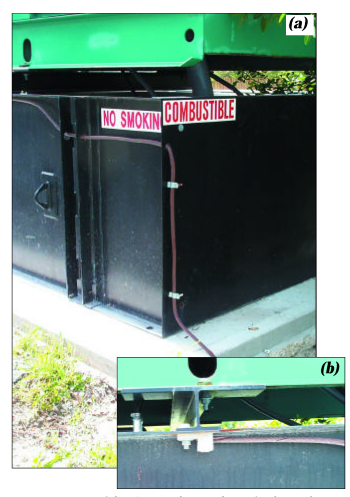
Figure 5a. View of the 4/0 grounding conductor for the 200-kW emergency generator. This conductor is exothermically bonded to the buried grounding electrode system described in the text. Figure 5b shows the corrosion-resistant bronze clamp that bonds the 4/0 grounding conductor to the generator base.