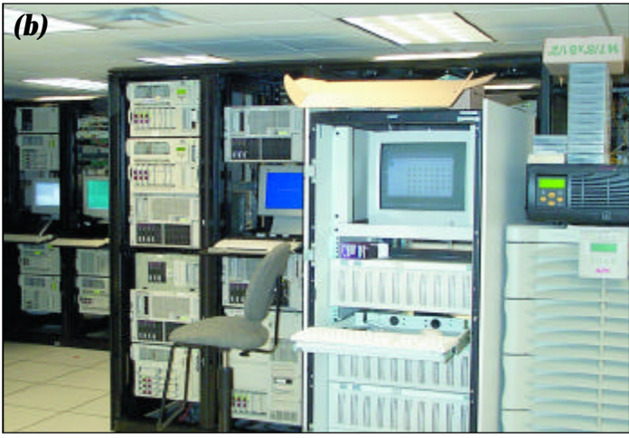
Figure 9. Suncoast Schools FCU's main computer room and the reason for the extensive grounding and surge protection described in this publication. Continuous power to the host computer (a) and various servers and other equipment (b) is assured by means of the stand alone 16-kVA UPS seen at the lower right. Smaller UPS devices are located at individual workstations.