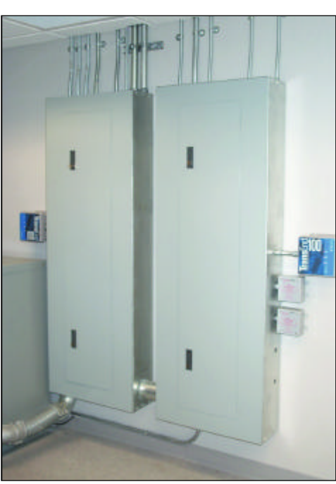
Figure 8. Two 120/208-V branch circuit panels supply the data center's computer room and other locations in the building, respectively. Each panel is protected by TVSSs rated at 100 A (blue enclosures). Fire alarm and fire call circuits are additionally protected by TVSS devices rated at 20 A. There are as many as seven lavers of surge protection in critical portions of the data center's electrical sys-