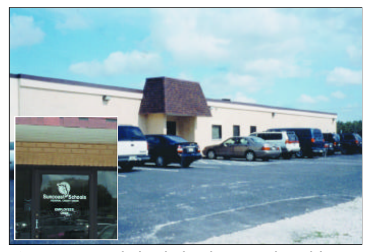
Figure 1. Suncoast Schools Federal Credit Union is the ninth largest organization of its type in the USA, serving more than 215,000 members in 15 Florida counties. The bank's Tampa annex building (cover) is closely linked with a nearby data processing center (above) and with 28 branch offices throughout the Gulf Coast region. Because it is located in Florida's notorious "lightning alley," the data center is equipped with a robust, all-copper grounding system and multiple layers of both surge protection and uninterruptible power supply devices.

uncoast Schools Federal Credit Union is the ninth largest organization of its type in the country, serving more than 215,000 members through 28 branches in 15 counties along Florida's Gulf Coast. It offers a full line of banking services and, like any modern financial institution, it conducts just about all of its business electronically. Its ATMs alone handle more than 1.5 million transactions per month.