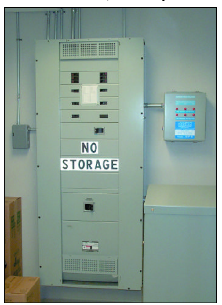
Figure 7. The 480-V distribution panel shown here feeds a 480\Delta - 208Y/120 -V transformer (lower right), the 277-V lighting circuit and the two air conditioning units. Connected to the 480-V bus at the right side of the panel is a 200-kA-rated TVSS that provides both lineground and neutral-ground protection.