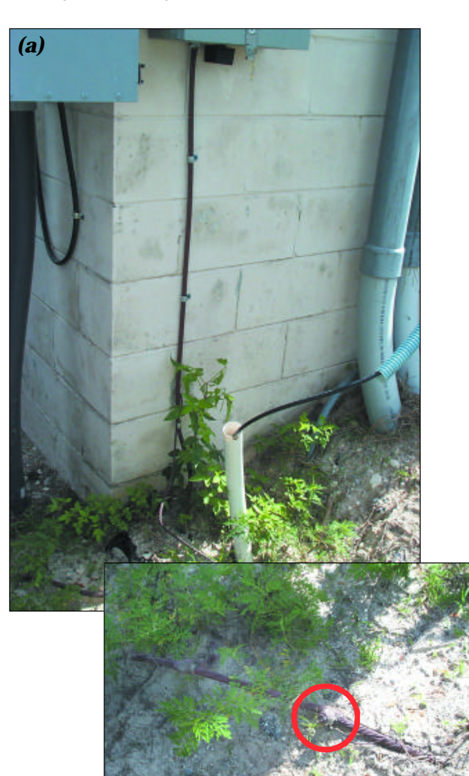
Figure 4a. The main grounding electrode conductor extends from the electrode array to the meter box (vertical cable) and to the service entrance panel seen at upper left. The 4/0 grounding cable leading to the right connects to the air-conditioning equipment subpanel. Exothermic welds (Figure 4b) connect the grounding electrode conductor to other outdoor equipment.

"The amazing thing is that no one in the center even knew we were hit! The lights flickered a bit, but that's not unusual around here. Thinking back on it, what was really scary was that all of our very expensive data processing equipment and a lot of important financial data could have been destroyed in an instant. Instead, the center just kept on working as if nothing had happened."