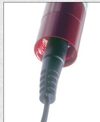
No tools, interface cards or docking stations required.

To setup, download or view realtime information from an ACR Bottle Data Logger; all that's required is an ACR IC-101 Interface Cable. Connection is simple. Plug the IC-101 connector into your PC's serial port and the stereo cable into the logger. The IC-101 cable is included with the Bottle Logger Interface Package.