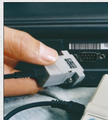
How the IC-101 connects between the SmartReader Data Logger and the PC serial port.

To setup, download or view realtime information from an ACR SmartReader Data Logger, all that's required is an ACR IC-101 Interface Cable. Connection is simple. Plug the IC-101 connector into your PC's serial port and the stereo cable into the ACR Data Logger. The IC-101 cable is included with the ACR TrendReader® Interface Package. No tools, interface cards or docking stations required. To setup, download or view realtime information from up to 8 loggers at once, locally or over a modem, see page 34, SmartReader Networking and Remote Communications.