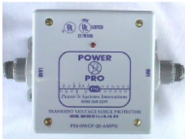
PSI 120 HWCP-20